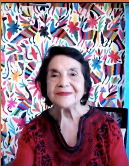
Dolores Huerta June 14th HCN virtual rally