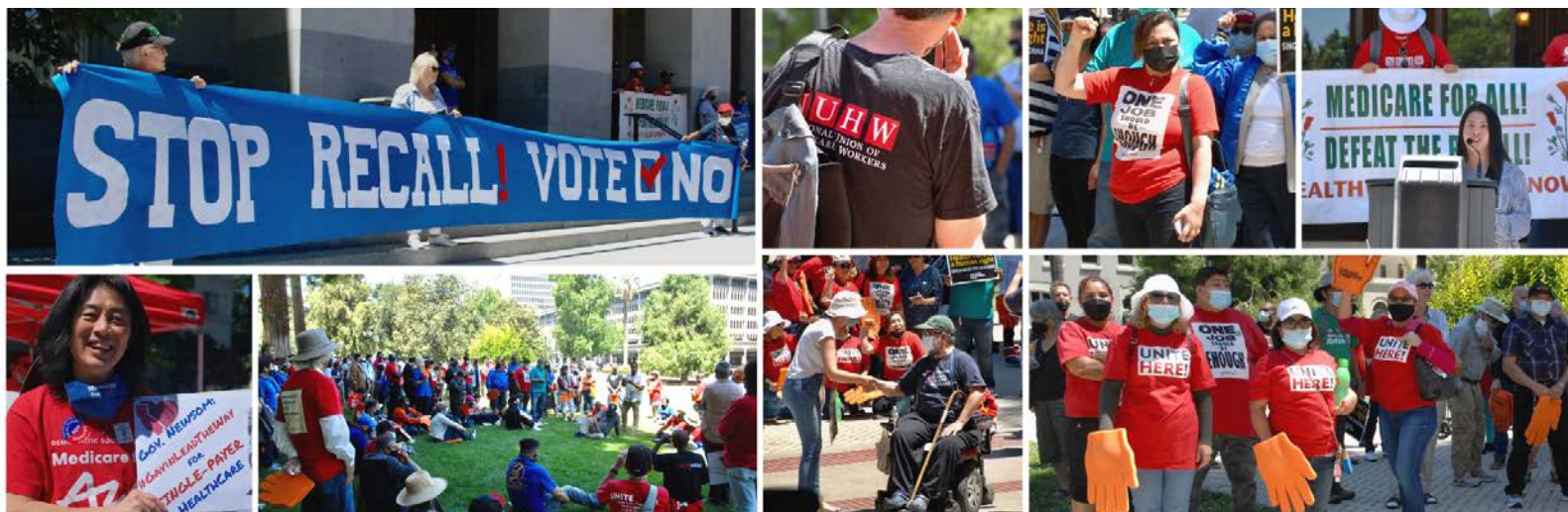
more found HERE